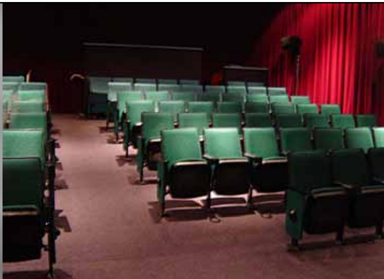
Second hand Cinema seats & curtains were purchased from Hoyts (Sydney)