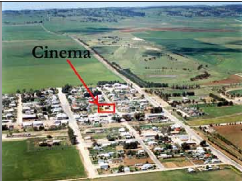
Blyth – town population 300 140kms north of Adelaide, 13kms west of Clare