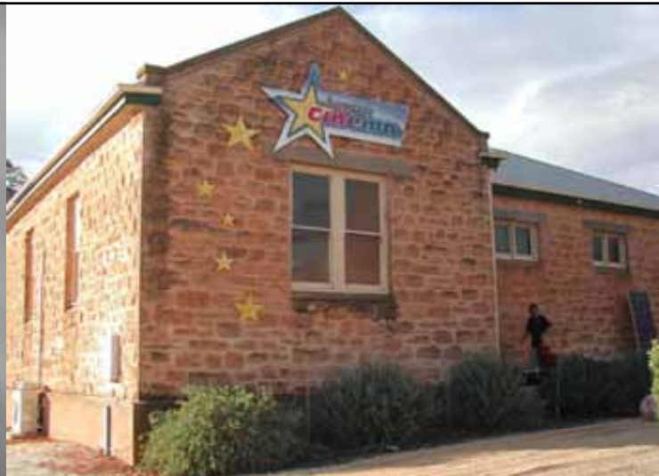
Blyth Cinema – formerly Blyth Masonic Lodge premises, built 1958. An unassuming exterior hides a real treasure once inside.