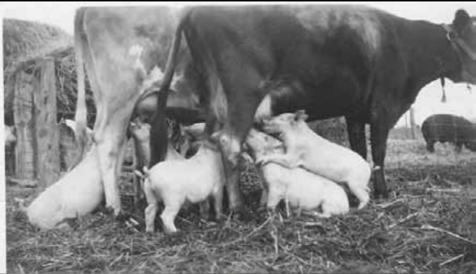
Piglets on a farm at Hart have deserted their mother & "adopted" 2 cows. C.1942