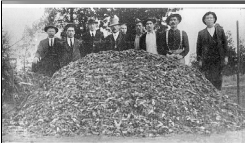
11 drayloads of mice in 1917 mouse plague = 500,000 mice-4 nights catch at one rail yard in SA.