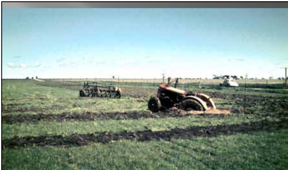
Photo taken in the very wet year of 1956