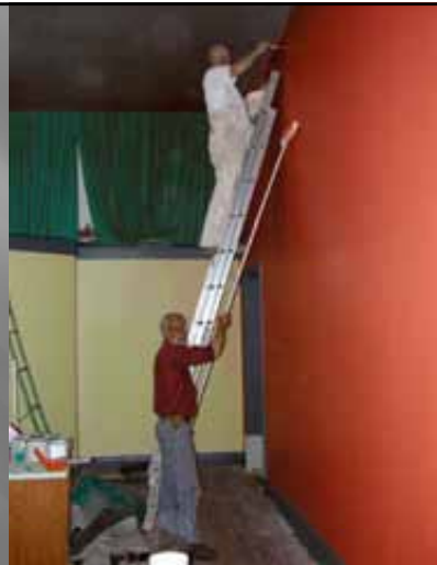
All landscaping, painting, installation of seats & curtains was completed by volunteers