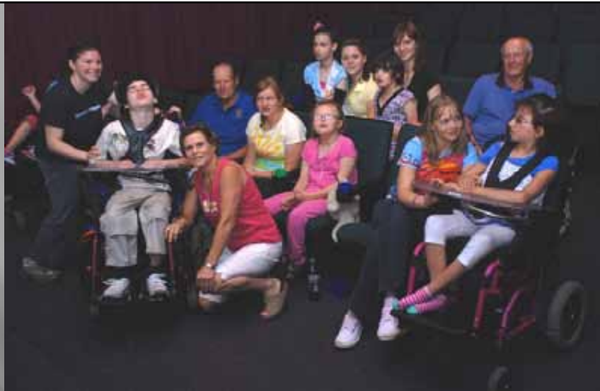
Hosting Clare Lions Club movie night for CARA Camp teens