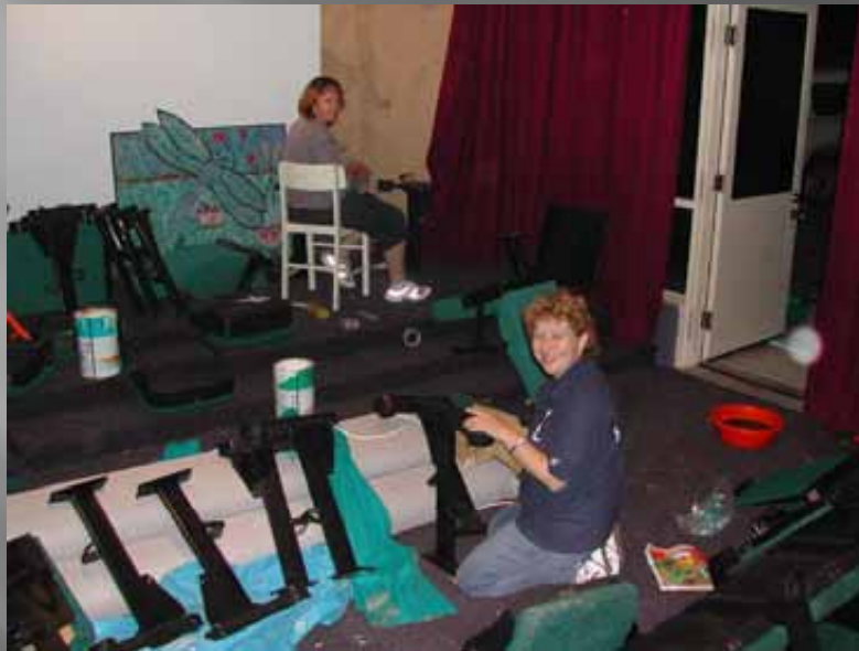
Cleaning seats & hanging curtains.