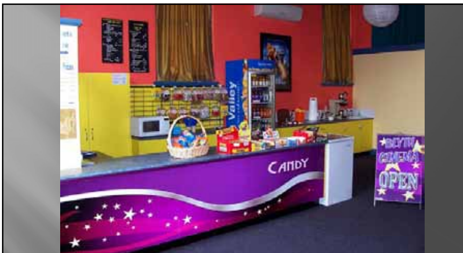
Candy Bar design work donated by a local designer. We inspected cinemas in Adelaide & Perth when looking at colour schemes