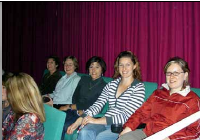
Women enjoying a local Primary School "Chick Flick" fundraiser