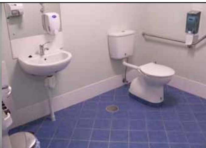
Communities are often judged by the quality of toilet facilities. We were keen to ensure we got these right & were easily accessible by disabled guests. They were our single biggest cost.