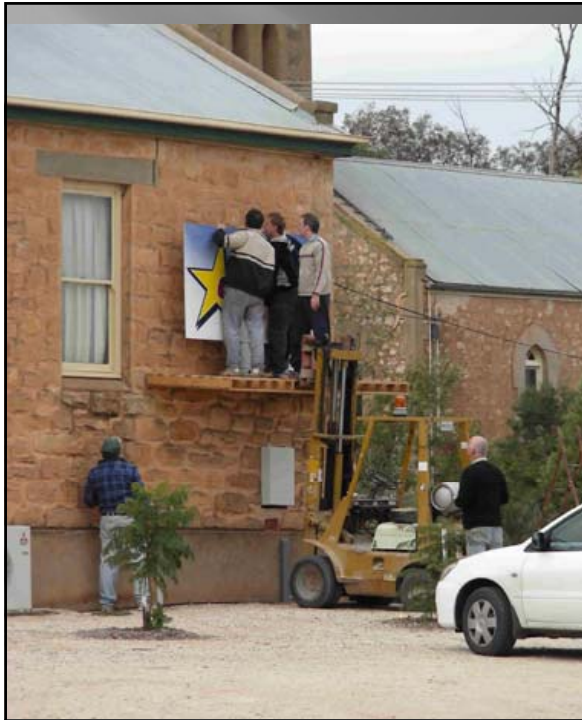
Volunteers putting up signage