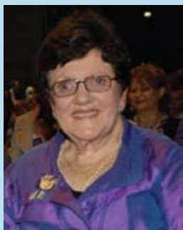
THE HON. JOAN KIRNER AM

Joan Kirner cut her teeth in community activism in school and parents' organisations before being elected to Parliament in 1985. While making her mark as a key parliamentarian and Minister, Joan never lost touch with the grassroots, playing an instrumental role in activities such as the formation of the first Landcare groups, and key educational reforms aimed at promoting social inclusion. Joan became Victoria's first female Premier in 1990, taking over at a time of deep crisis. Since leaving Parliament in 1994, she has remained an active community advocate and champion for the disadvantaged.