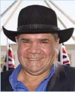
PROFESSOR MICK DODSON AM

Professor Mick Dodson AM has spent decades at the forefront of justice and reconciliation efforts in Australia. A Yawuru man, Prof. Dodson provides a living example of the Communities in Control ethos through his thoughtful, uncompromising and inclusive efforts to create understanding between all Australians and pursue justice for his people. The 2009 Australian of the Year, who is a self-described “persistent bopper,” has served in a variety of challenging and highly sensitive roles at community level, with governments, global NGOs and academia.