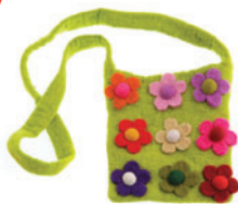
Blessed-Life: Felt Flower Bag $25