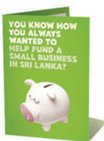
Oxfam: A small loan to help Sri Lankan women start a small business such as brick-making or tailoring $14