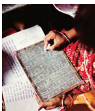
TEAR Australia Fund Adult Literacy Lessons $35