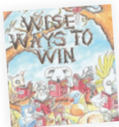
Psychologists for Peace: Wise Ways to Win Children's Book $15