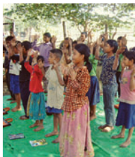
TEAR Australia Help Stop Human Trafficking $20

Buy a toilet for a friend in Toowoomba and transform the health of a family in Tanzania. With TEAR's Useful Gift Catalogue, we're all connected: it's six degrees of sanitation. www.usefulgifts.org