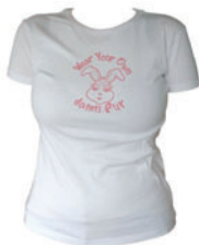
Animal Liberation QLD: "Wear your own damn fur" t-shirt $28