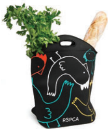
RSPCA: RSPCA Neoprene Shopper $29.95