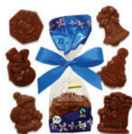
Animals Australia: These delightful Bonvita Christmas themed figurines are smooth, creamy, decadent and dairy-free $9