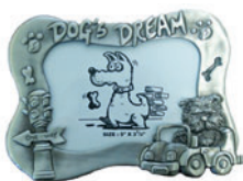
Animal Aid: Woof Photo Frame $15