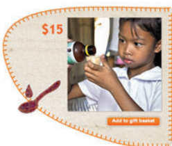
World Vision: Supplementary vitamins for children $15

BAHAY TULUYAN provides services and programs that aim to prevent and respond to the abuse of children in the Philippines. Philippine children and their communities create jewelry and other products from recycled magazines and other materials. http://bahaytuluyan.org