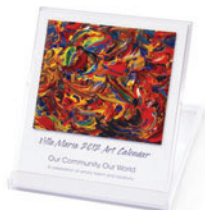
Villa Maria: Desk Calendar $12