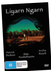
ANTar: Liyarn Ngarn DVD. Compelling documentary of the devastation and inhumanity brought upon Indigenous people $25