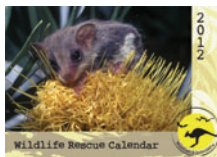
Wildlife Rescue South Coast: 2012 Calendar $10