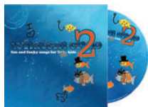
Bluebird Foundation: Whatem 2 CD $24.95