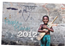
People and Planet: 2012 calendar $24.95