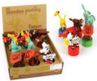
Autism Advisory & Support Service: Wooden Animal Push Puppet $3 each