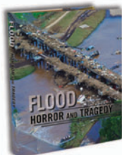
AGNEW School: Flood, Horror & Tragedy Hardcover Book $49.95