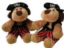
Mater Foundation: Miracle MaX pirate plush toy 14cm $10