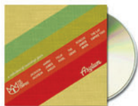
Tunes for Change: Asylum Album You decide the price (Min $5 Suggested $25)

http://parkinsonsnsw.org.au/support-us/merchandise-catalogue/