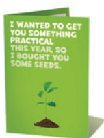
Oxfam: High-quality fruit tree seeds, so farmers in East Timor can increase their crop yields $10