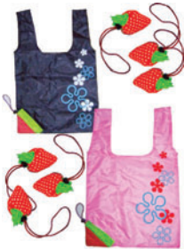
AUSEE: Unfold this cute little strawberry to pull out a full size reusable tote bag. $4