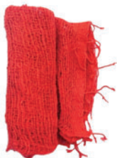
Orphfund 100% Cotton Scarf $22

THE RSPCA is selling its wildly popular Christmas cards ($5.95), traditional puddings ($39), diaries ($24.95) and plenty of other gift items this Christmas. By purchasing gifts from the RSPCA you will be supporting their protection of all creatures, great and small. Besides, who doesn't like gifts covered in pictures of puppies or kittens at Christmas! http://shop.rspcavic.org.au/t-hometopintro.aspx