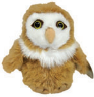
Glaucoma Australia: Goldie - Owl 19cm $17