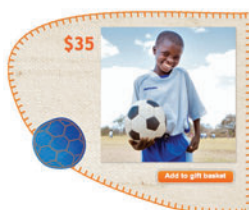
World Vision: Support sports and recreation in poor communities. $35