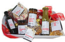
Kommerical Kitchen Gourmet Hamper $50