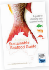
Australian Marine Conservation Society: Australia's Sustainable Seafood Guide $9.95