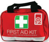
St John Ambulance Australia: Small Leisure First Aid Kit in Nylon Carry Pouch $49.95

GLAUCOMA AUSTRALIA has a selection of unique Christmas cards and merchandise for sale this year. Sales of all items will go towards supporting glaucoma awareness and education programs in the community. Merchandise includes Goldie the Owl ($17), the mascot for glaucoma awareness. http://www.glaucoma.org.au/shop.asp