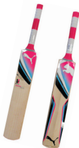
The McGrath Foundation: Puma Calibre Reserve McGrath Foundation Cricket Bat $300