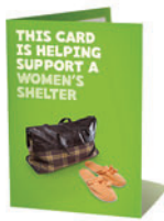
Oxfam: This card will help pay for a women's crisis centre in Papua New Guinea $25