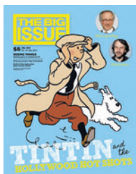
The Big Issue 12 months/ 25 issues $155