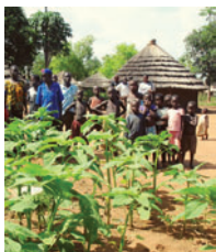
TEAR Australia Provide a kitchen garden $29