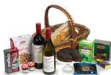
Mirabel Foundation: Christmas Treats Hamper $89.95

www.villamaria.com.au/support-us/merchandise.html