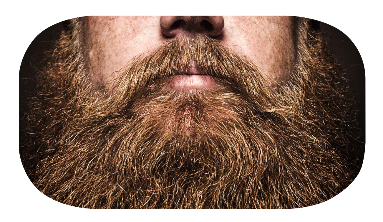
We all know what a beard is - up to a point.