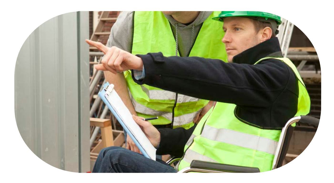
Problem-solving and collaboration come naturally to some leaders - but particularly disability leaders.

are out in the mainstream. This is still a very unresearched area and it needs a lot more work. so the DLI's current research has focused on the first group.