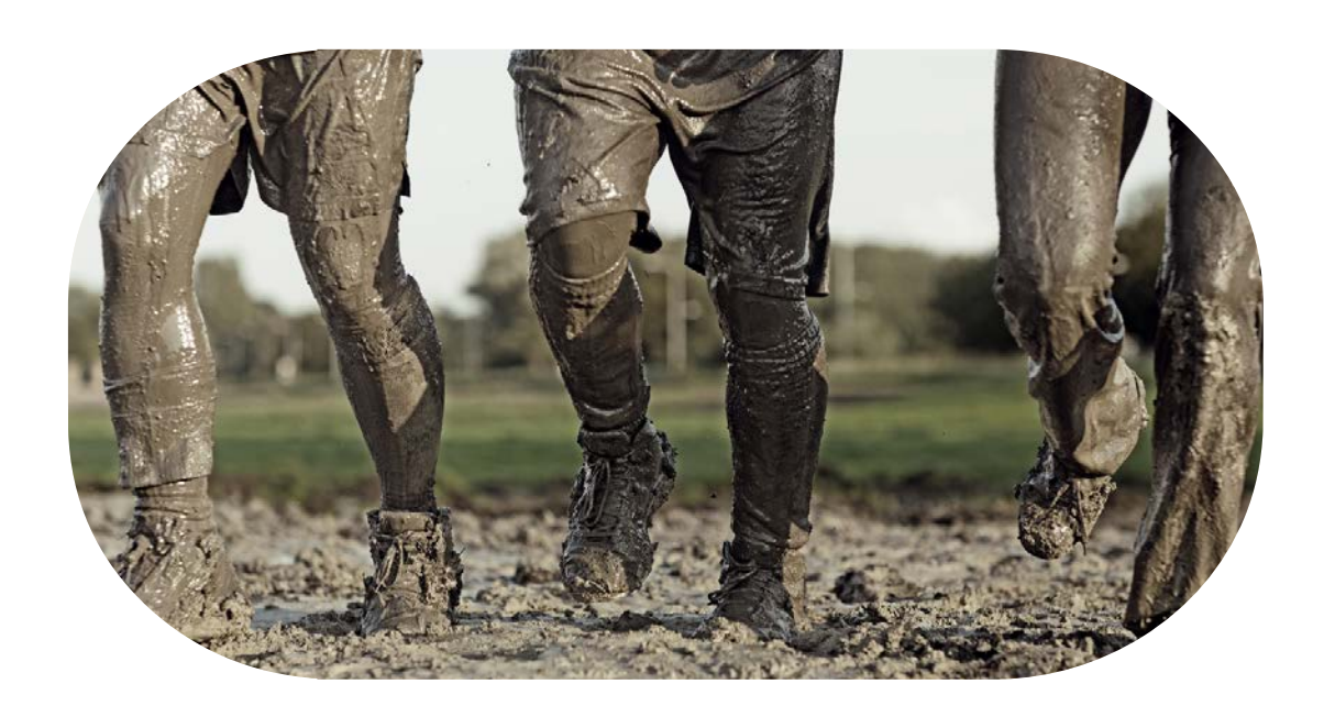
Disability leaders don't need wilderness training to build resilience and persistence – they've accumulated these qualities over a lifetime.

disabilities are leaders and have considerable qualities to contribute to shaping Australia's future. Disability leaders are potentially the missing element that is needed to improve those global business rankings.