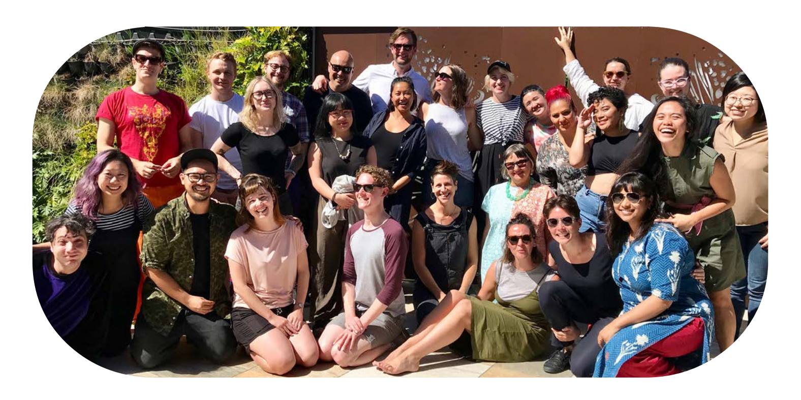
Members of the 2018 Future Leaders intake.

We have also opened up the program through our Leadership Exchange program, inviting 200 other arts leaders to sessions in centres such as Dubbo, Hobart, Cairns, Gold Coast, and Adelaide.