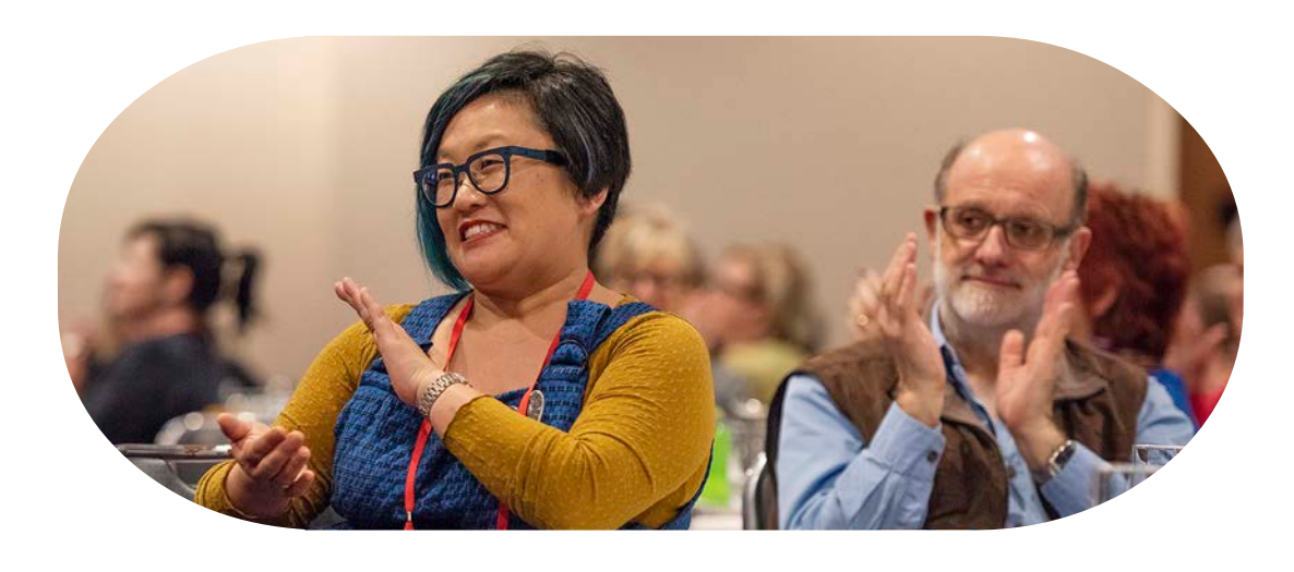
Delegates at the latest Communities in Control conference.

Each year, Our Community hosts the Communities in Control conference for 1000 representatives of community organisations and not-for-profits, activists and progressive thinkers from across Australia and beyond.